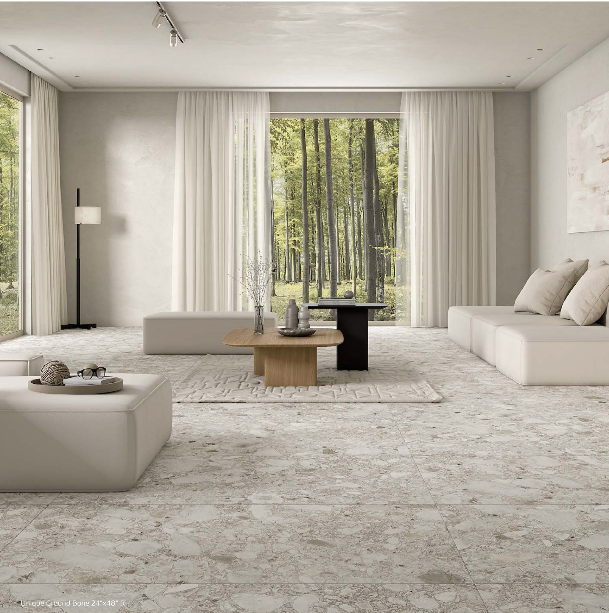
Unique Ground Bone 24"x48" R

Accurately reproduces the Italian stone “Ceppo di Gre” with large pebbles and mineral sediments embedded in its surface. The Unique Ground series, along with its neutral and chromatic hues, is elegant and sophisticated.